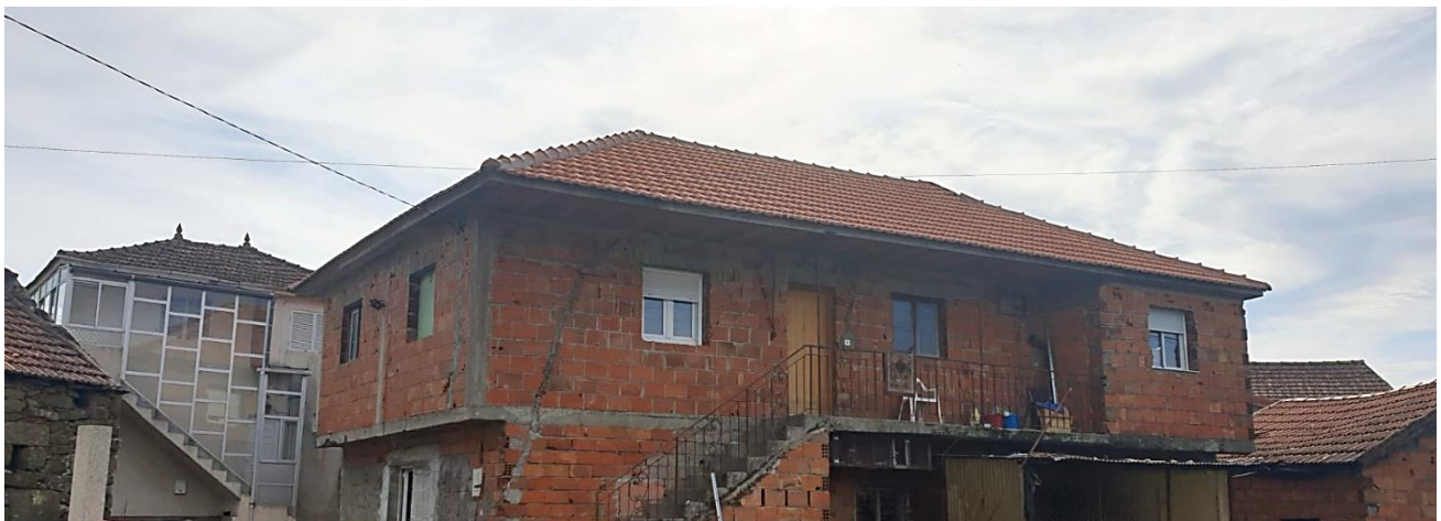
Roof Rehabilitation at a house at Covas do Barroso

Such actions will be maintained throughout our time in the region. This will always be the mark Savannah will leave.