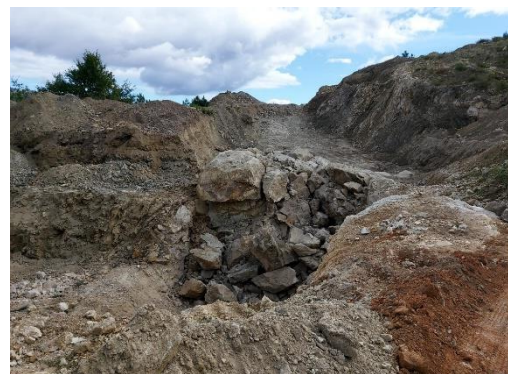
Fieldwork – Blasting at NOA