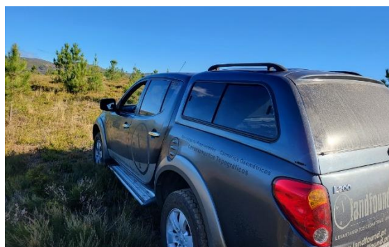
Field work – Land Acquisition Programme Team

For several more properties, we are awaiting the legalization of documentation, in order to move towards the promissory purchase and sale contracts and the respective public deeds.