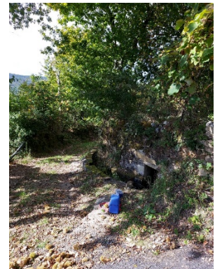
Fieldwork – Soil collection, blasting and vibration monitoring