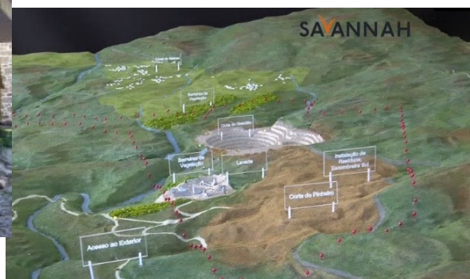
Barroso Lithium – Information Centre and 3D Model