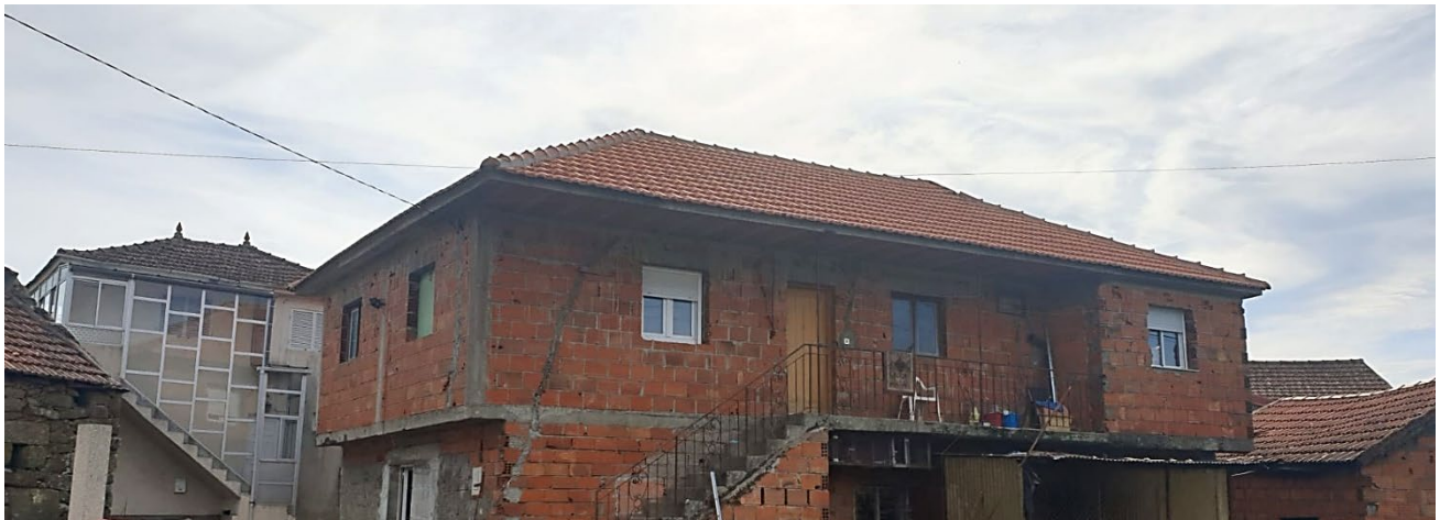
Roof Rehabilitation in a house at Covas do Barroso

It is Savannah's goal to always leave a positive legacy, so we will be maintaining these types of actions during our presence in the region.